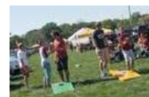
ISU tailgating vs. W. Illinois