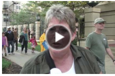
Reaction to Obama's speech at University of ... Sep 7, 2012