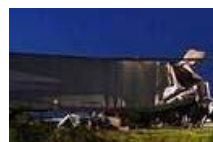
I-80 accident near Altoona